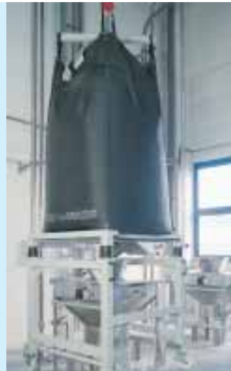
Discharging granular bulk material into collecting hopper without a big bag docking system, as no dust is created.