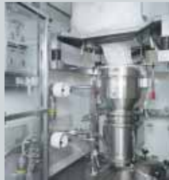
Big Bag dumping station for discharging pharmaceutical products into a buffer hopper