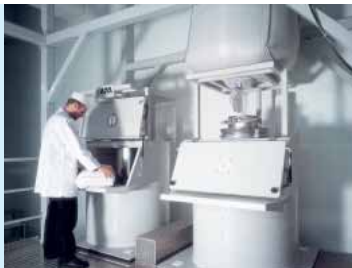
Hopper combined with big bag dumping system used in a bread factory