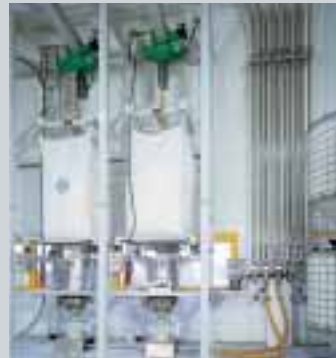
Big Bag dumping station with integrated lifting device for positioning big bags for baking mixes. After discharge, the products pass through rotary valves to the pneumatic conveying systems. Via a manual coupling station it is possible to feed different indoor silos.