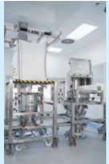
Pharmaceutical industry solution: big bag with forklift cross-bar - outlet tightened by means of lifting device