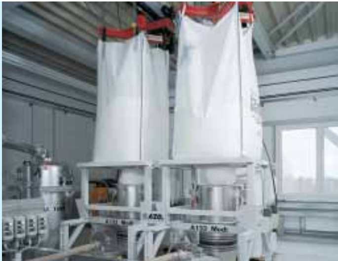
Big bags with 2,000 litre capacity and fixed docking systems i.e. the tension to allow complete discharge is achieved by the lifting device. The big bag is raised just before it empties completely, creating a funnel shaped cone.

Our big bag dumping systems are constantly being developed. We are currently working on contamination-free docking and connection systems which prevent any dust escaping.