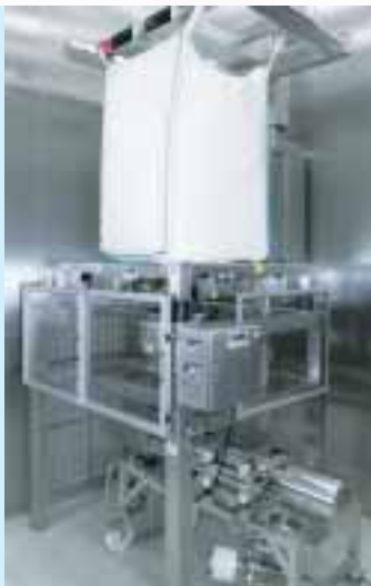
Big bag dumping station for pharmaceutical products with downstream safety screening