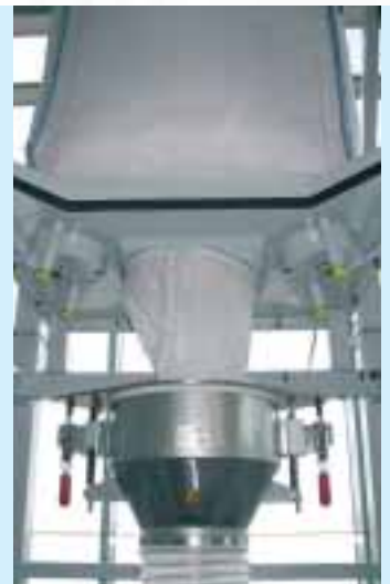
Big bag dumping station with message device. A vibrator can also be used as an alternative.